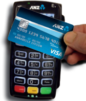
Tap contactless card, smartphone or wearables